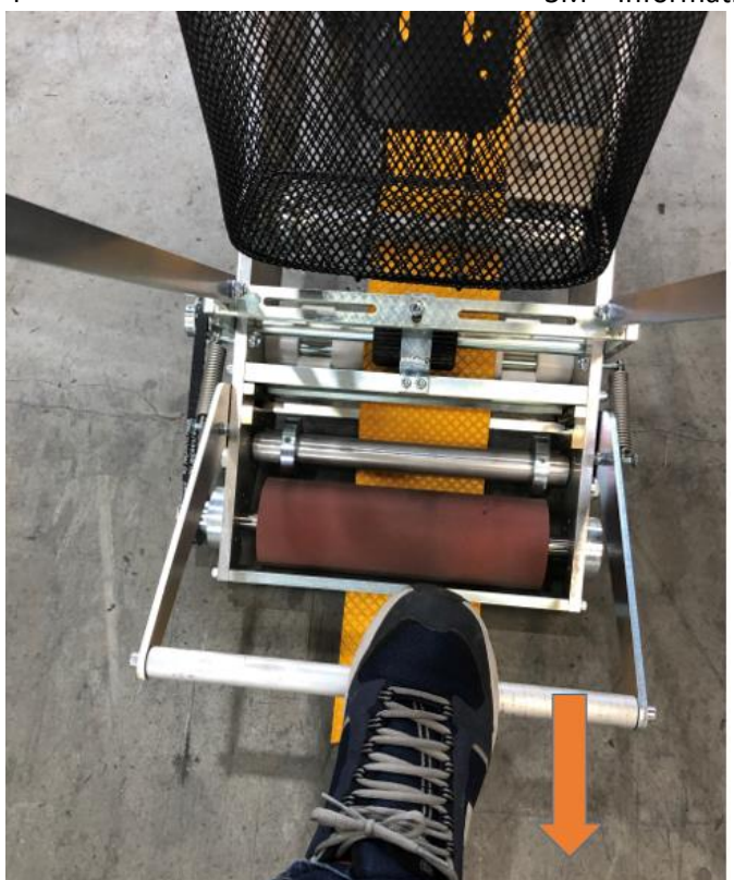
RTC 3 for tamping